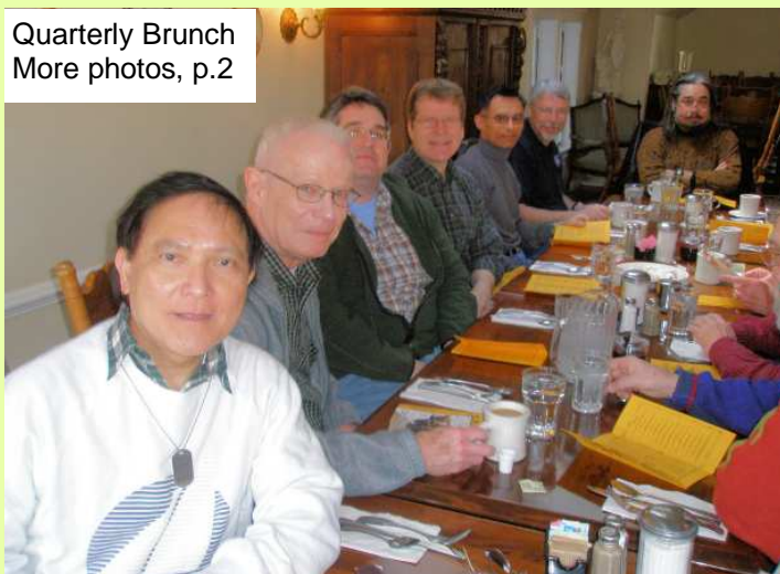
Quarterly Brunch More photos, p.2